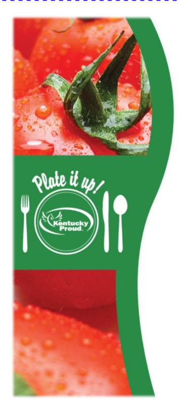
Plate It Up Kentucky Proud Recipe