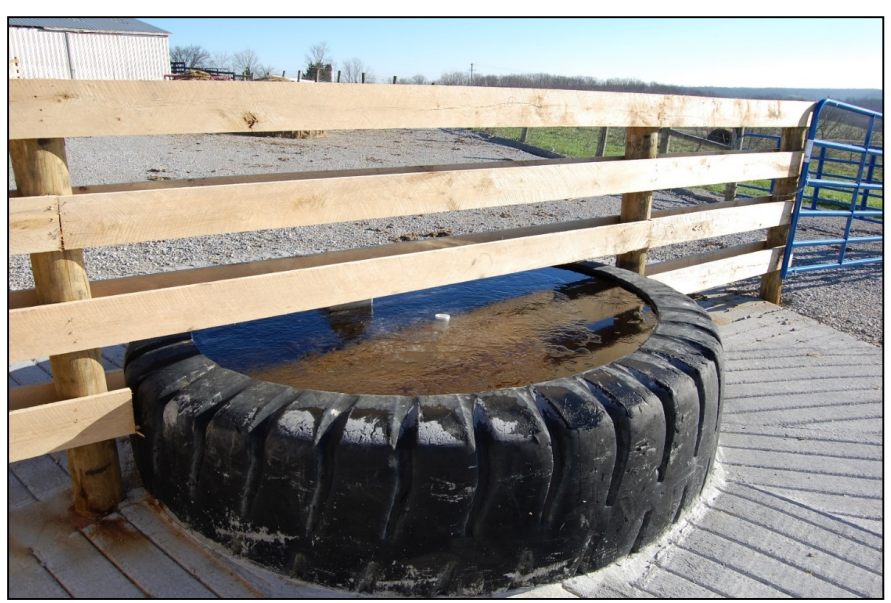
power supplied to the pump by up to 30%.

as a linear current booster, which allows for the pump to operate at lower light levels and can boost the