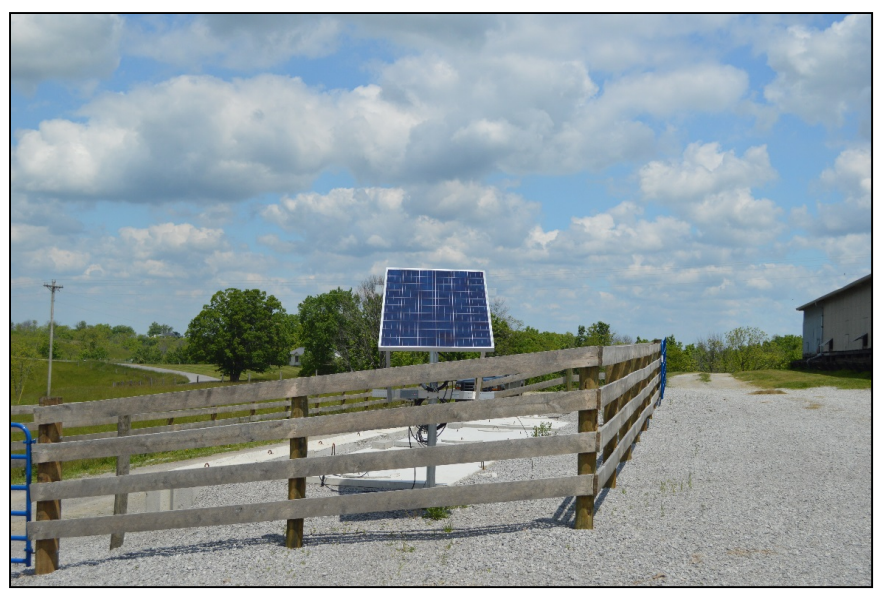
A solar powered pump installed in a water harvesting system.

Definition: The practice of using a solar panel and pump to distribute water within a water harvesting system. This practice includes the infrastructure necessary to direct, store, and distribute water. This practice is supported by NRCS practice standard codes 570: Stormwater Runoff Control, 614: Watering Facility, and 636: Water Harvesting Catchment. This practice is eligible for cost share through CAIP and EQIP in Kentucky.