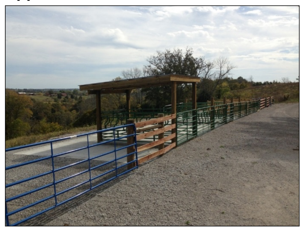
Fenceline Feeding System demonstration site at Eden Shale Farm

Definition: The practice of installing livestock feeding structures into strategically selected fencelines in close proximity to feedstuff storage facilities. This practice is supported by NRCS practice standard codes 382: Fence and 561: Heavy Use Area Protection. This practice is soon to be eligible for cost share through CAIP and EQIP in Kentucky.