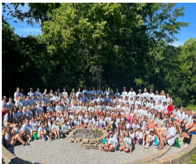
2022 Summer 4-H Camp