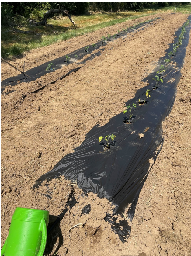
A tomato variety trial was established locally to better understand the impact of early blight on different varieties. Data from this plot will eventually be combined from other trials around the state.