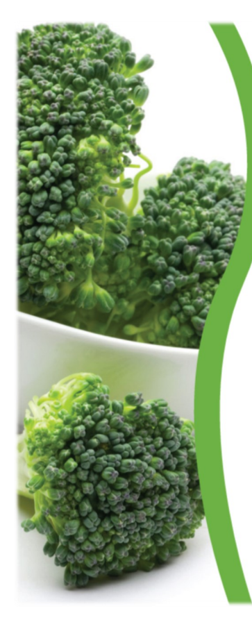
Plate It Up! Kentucky Proud Recipe

Drop off 16 oz. jars to the Bourbon County Extension Office, 603 Millersburg Rd., Paris by March 24 , 2023